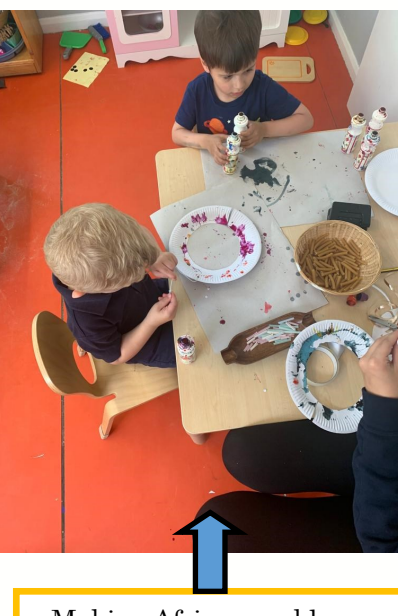
Making African necklaces