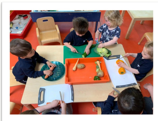
Chopping Vegetables Practising fine motor skills