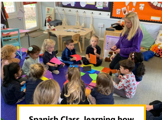
Spanish Class, learning how to say the names of colours