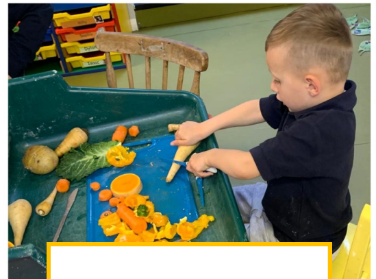
Chopping up vegetables