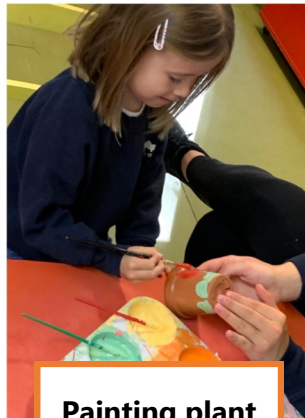
Painting plant pots